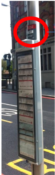
SMS Plate, not feature in main guide