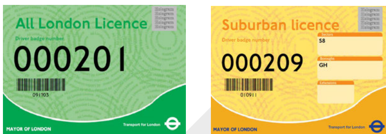
Figure 3 - Taxi driver identifiers

Due to the wide-ranging combination of licence areas for suburban drivers, this information is set out in codes rather than listing the specific areas by name. These codes and some examples of combinations can be found at Appendix G .