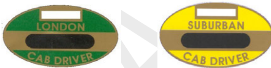
Figure 2 - Taxi driver badges

Taxi drivers' badges are either green (All London) or yellow (Suburban) with the badge number engraved across the centre.