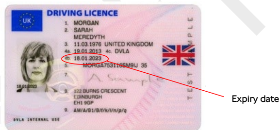
Figure 6 - Sample DVLA photocard

DVLA photocard are valid for 10 years after which they must be renewed. The expiry date is shown at 4b on a photocard.