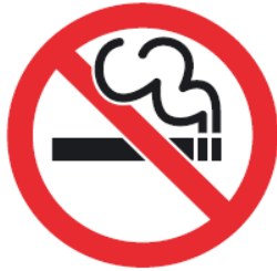
Figure 9 - Sample 'No Smoking' sign

Responsibility for enforcing no smoking regulations sits with local authorities rather than TfL. However, as the licensing authority, TfL will investigate any allegations of licensed drivers smoking and any adverse findings may be taken into consideration in determining driver's fitness. Further details regarding handling allegations of drivers smoking are set out in TfL's guidelines for handling taxi and PHV complaints.