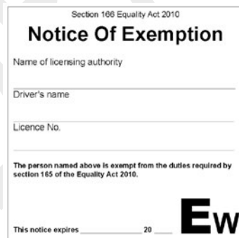
Figure 7 - Assisting passengers in wheelchairs Notice of Exemption

Exemptions are not indefinite and the length of the exemption will be based on the medical need. The Notice of Exemption displays the expiry of the exemption and this should not exceed the expiry date of the driver's current licence. If the medical condition is not permanent a further exemption application must be submitted with the licence renewal application. If the driver's medical condition is permanent further exemption applications are not required but a new Notice must be issued with each licence.