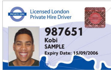
Figure 5 - PHV driver's badge

A written warning will be the norm for a first offence in the period of the current and preceding licence. Unless there is significant mitigation, further offences in the same period will result in the suspension or revocation of the driver's licence.