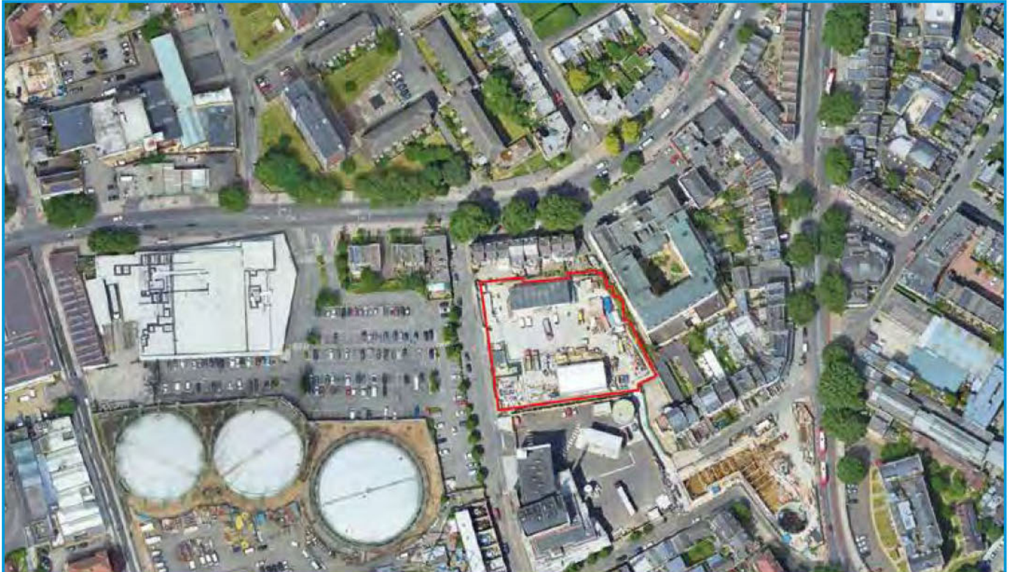
Montford Place site outlined in red