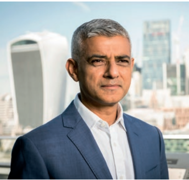
Sadiq Khan Mayor of London

From 25 October 2021, the ULEZ will be expanded to create a single, larger zone, covering the inner London area up to the North Circular Road (A406) and South Circular Road (A205) to help improve air quality. The North and South Circular Roads themselves are not in the zone.